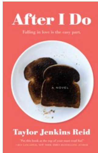
After I Do

A breathtaking novel about modern marriage, the depth of family ties, and forging your own path to happily ever after.